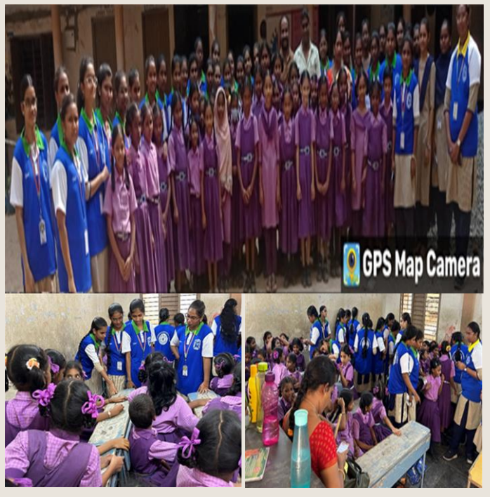
On the eve of International Girl Child Day i.e 11<sup>th</sup> Oct 2023 NSS Unit-I from different sections attended the Government public School in Mogalrajpuram Vijayawada.