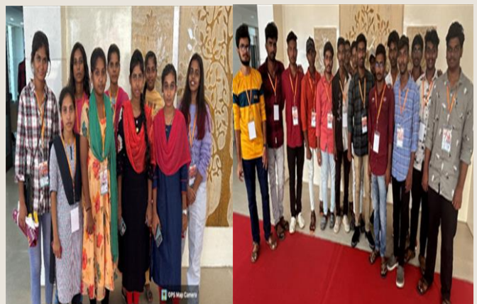
NSS Unit-I volunteers has attended the Special Meeting "Social Media impact on Youth and Role of Social Media of Youth" organized by the Central Government on 16th Oct 2023.