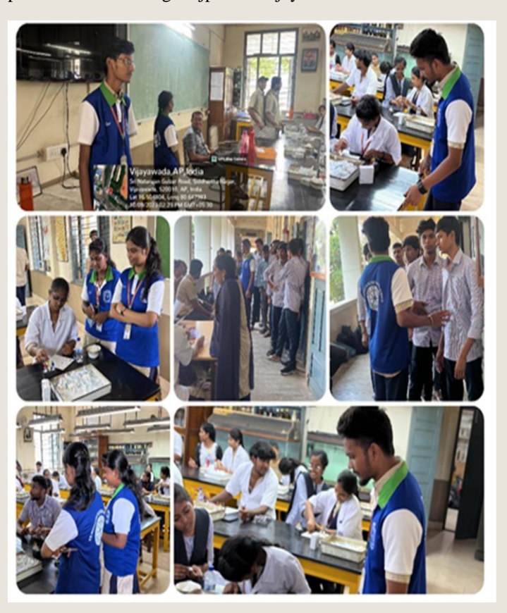
Department of zoology conducted blood grouping for newly joined students. NSS Unit-I volunteers helped the department of zoology for arranging everything for blood grouping.